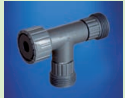
TKA Distribution manifold Made of plastic. 1 inlet, 2 outlets to which shutoff and distributing taps can be connected. R 3/4" connectors. No. 03.1420