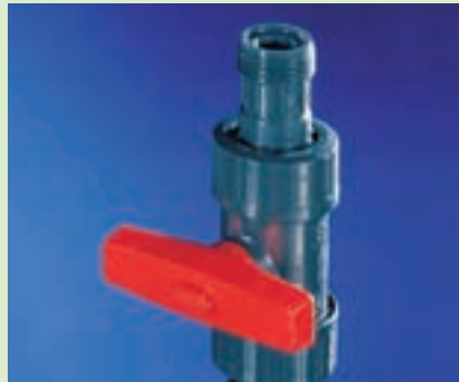
TKA Shutoff valve Made of plastic. Dimensions: 40 x 70 x 150 mm. No. 03.1403

Original accessories ensure long-lasting purified water quality.