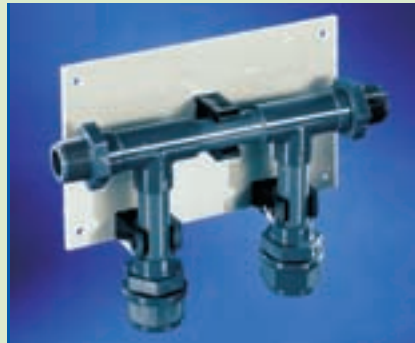
TKA Distribution manifold Made of plastic. 1 inlet, 3 outlets to which shutoff and distributing taps can be connected. R 3/4" connectors. No. 03.1402