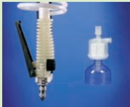
TKA Dispenser and sterile filter For connection to pressure-resistant TKA ion exchange cartridges for producing Aqua Purificata.