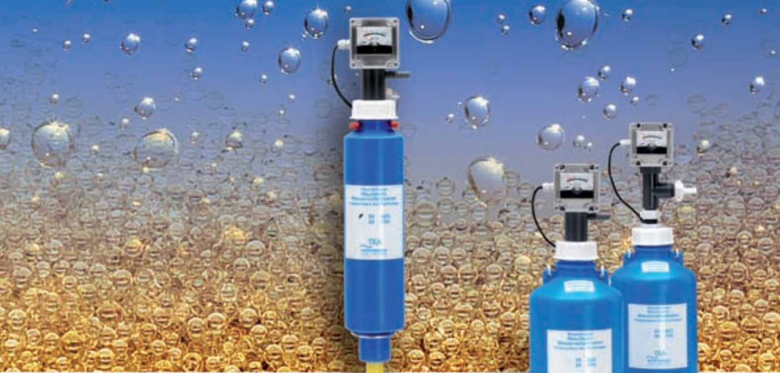
TKA DI 425