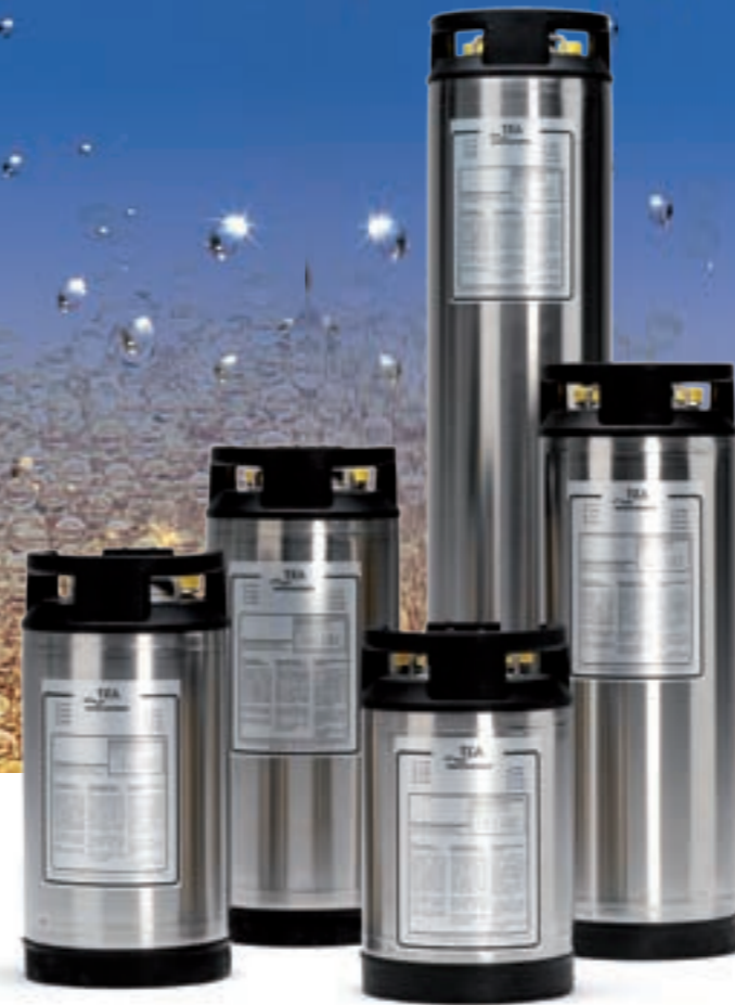
TKA-DI Ion exchange cartridges

Completely made of V4A stainless steel. Pressure-resistant up to 10 bar. Particularly economical for purified water requirements of up to 150 L/day.