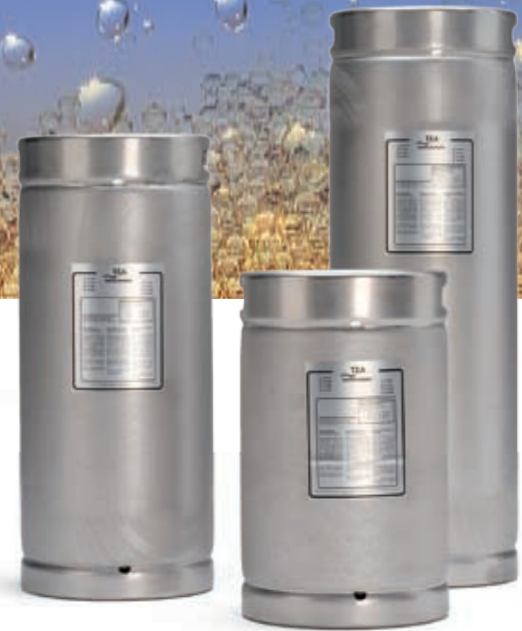
TKA DI Industrial ion exchange cartridges for up to 3000 L/h

Completely made of V4A stainless steel. Pressure-resistant up to 10 bar. Particularly economical for purified water requirements of up to 150 L/day.