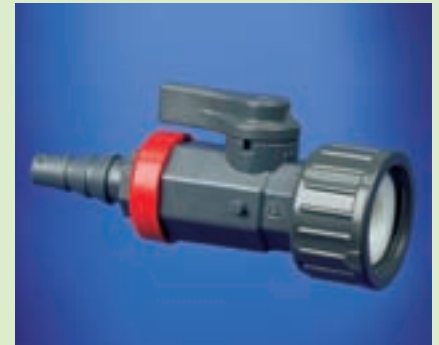
TKA Purified water outlet tap Made of plastic, straight. Connector R 3/4", coupling nut. Dimensions: 50 x 50 x 120 mm. No. 03.1400