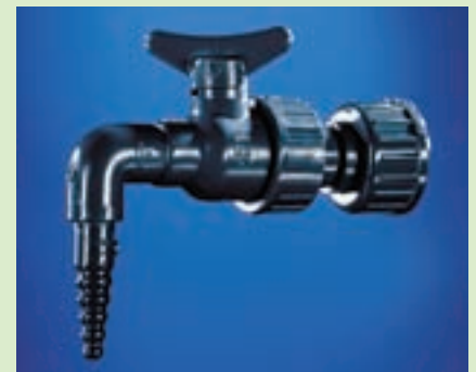
TKA Purified water outlet tap Made of plastic, angled. Connector R 3/4", coupling nut. Dimensions: 50 x 90 x 140 mm. No. 03.1401